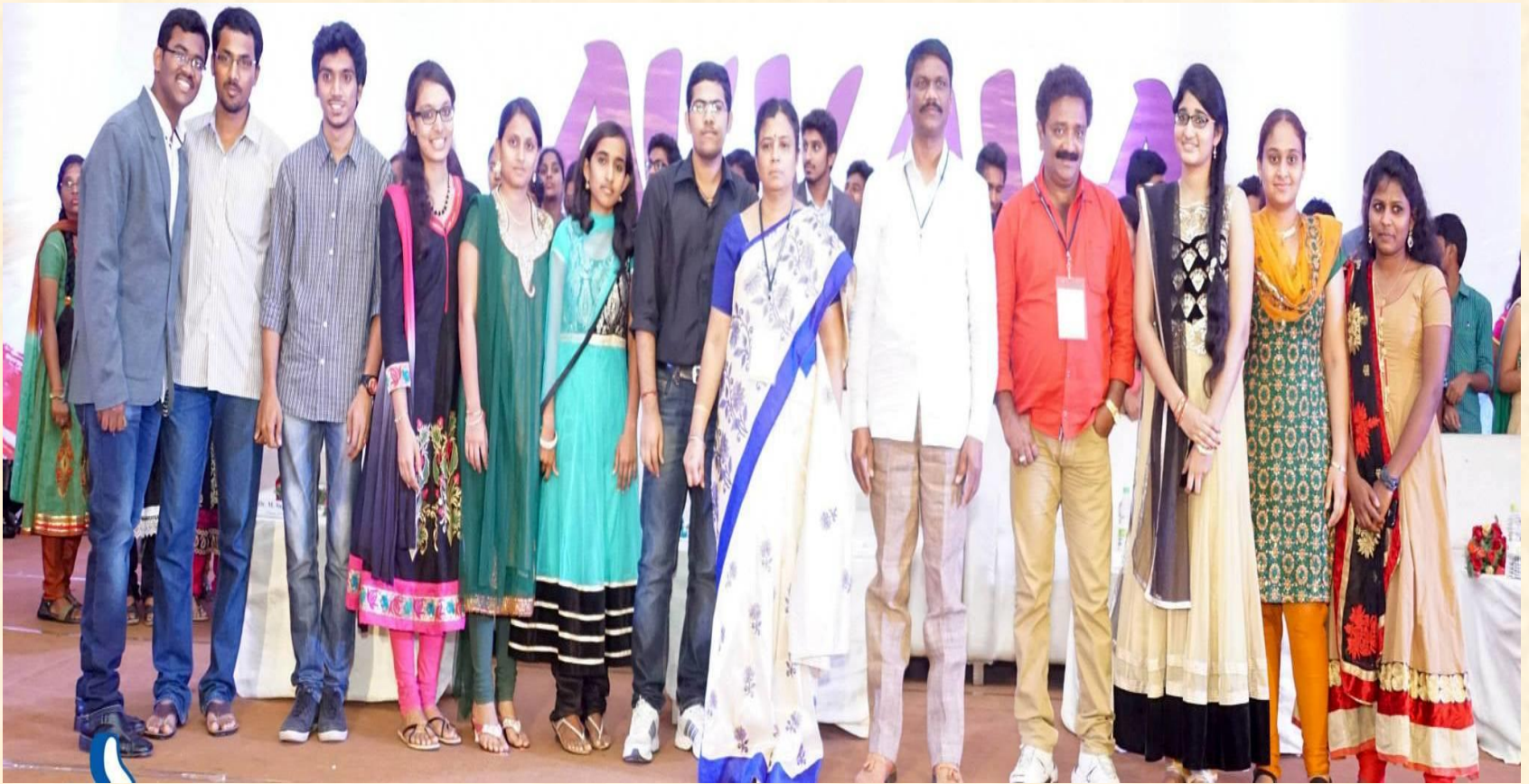
A snapshot with the CSE & IT students who got selected in Infosys