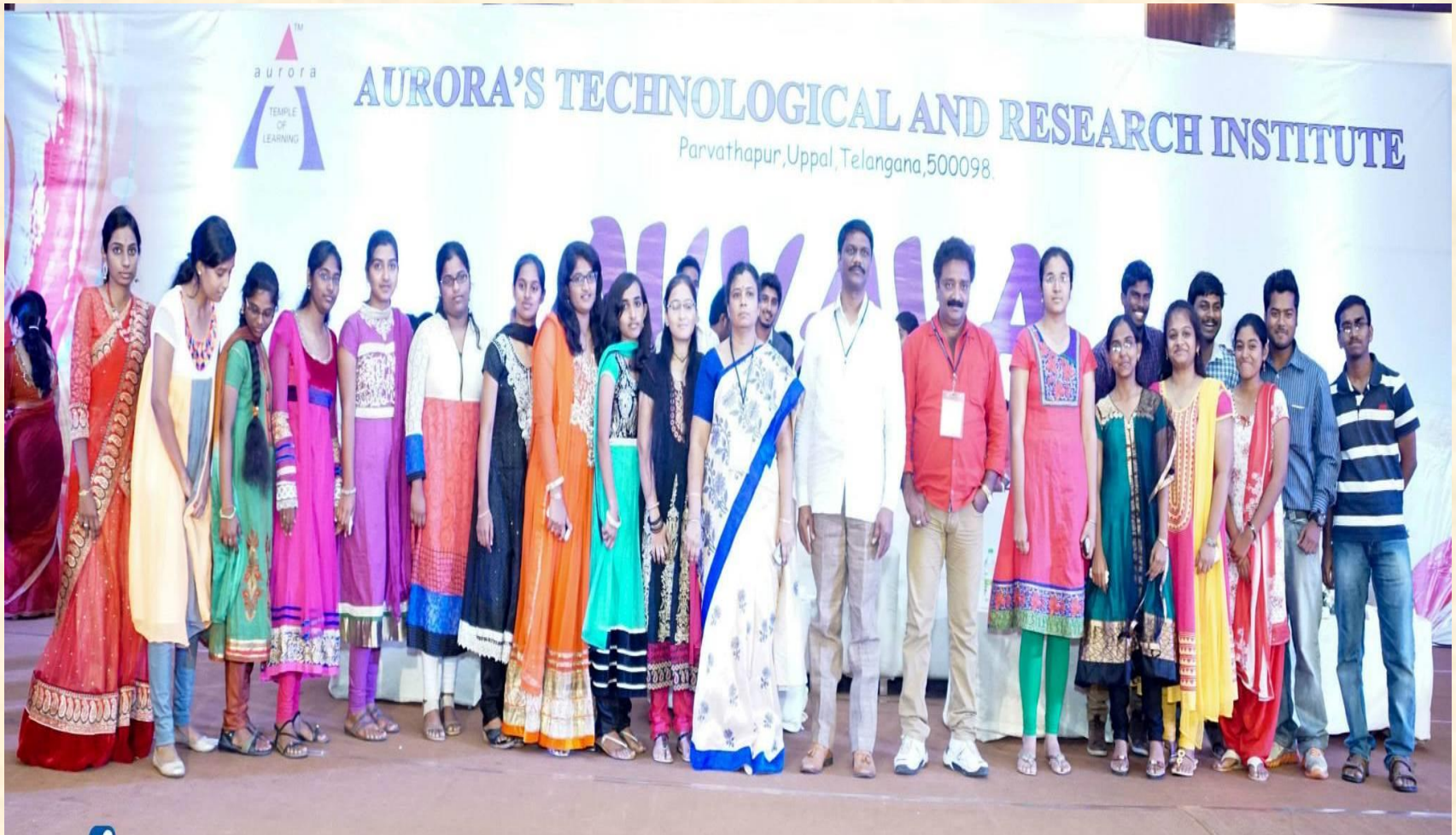
A snapshot with the ECE students who got selected in Infosys