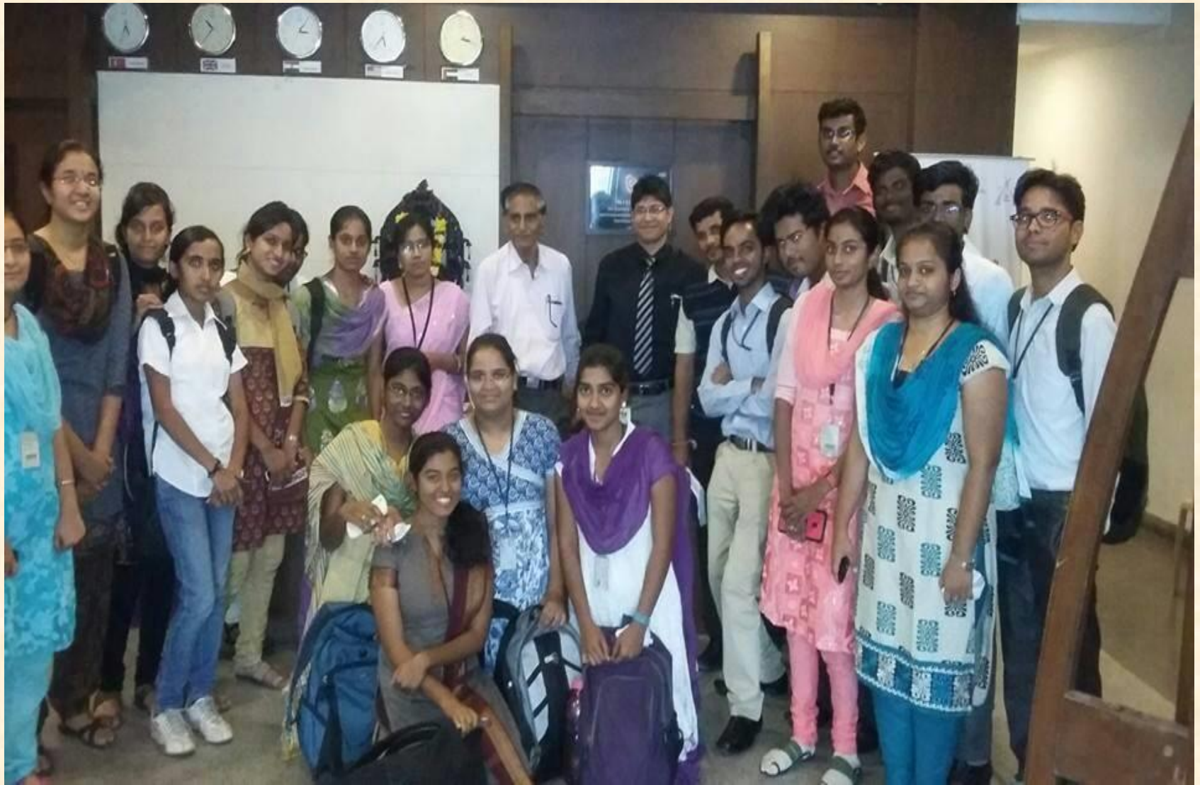
A snapshot with the students who got selected in different companies.