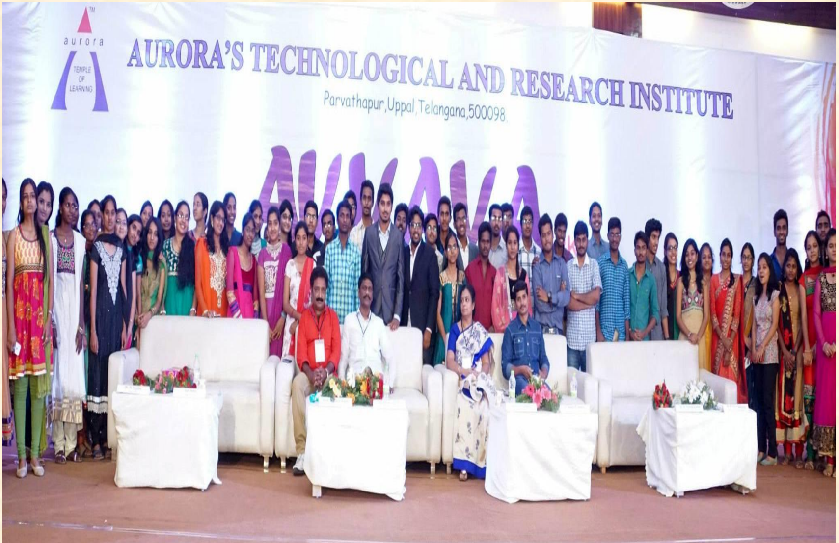
A snapshot with the students who got selected in different companies.